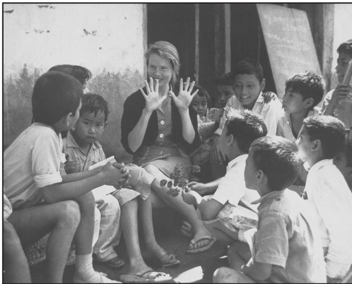
A Peace Corps Volunteer Working with Children in Nepal