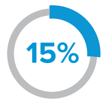
of businesses consider performance a top challenge