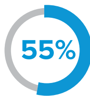
of organizations consider cloud security or compliance a top challenge

According to RightScale's 2016 State of the Cloud Report, organizations consider security, compliance and managing costs to be some of the most-significant challenges when moving to the cloud. However, legacy endpoint security solutions are unable to effectively protect virtualized environments because the rate of innovation is too rapid – users, virtual machines (VMs) and services are constantly changing.