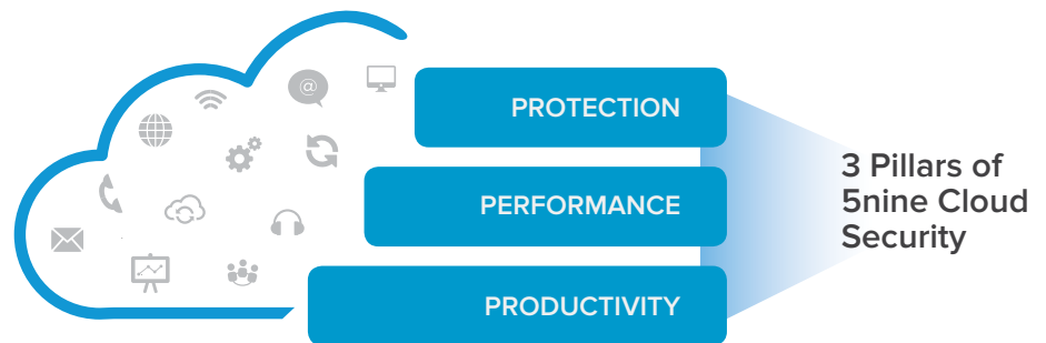
Key Considerations for Hybrid Cloud Strategy

5nine Software's comprehensive security and compliance solution for Hyper-V and Azure is optimized for protection, performance and productivity. Not only does it provide an automatic, immediate and efficient way to defend against threats, it is also specifically designed to be implemented and managed by system administrators with general (non-specialist) security skillsets.