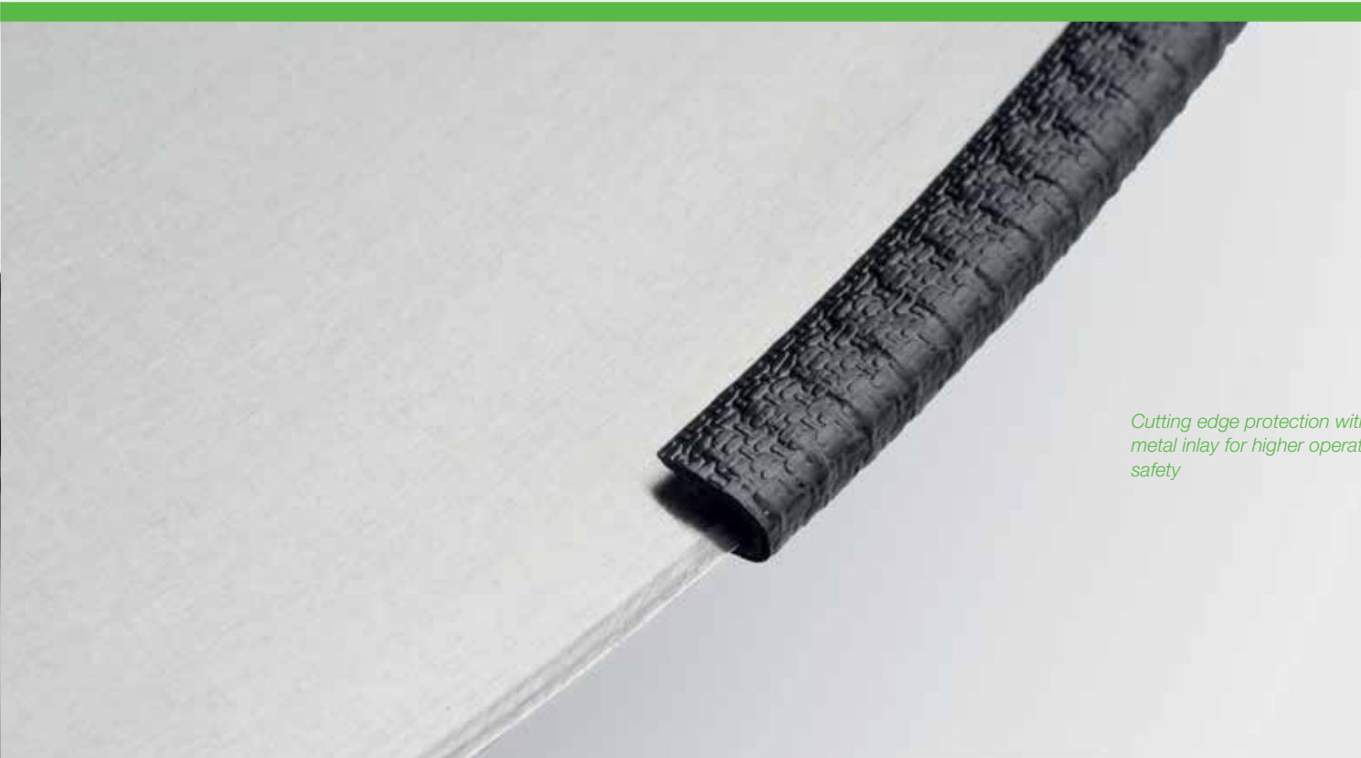
Cutting edge protection with metal inlay for higher operational safety