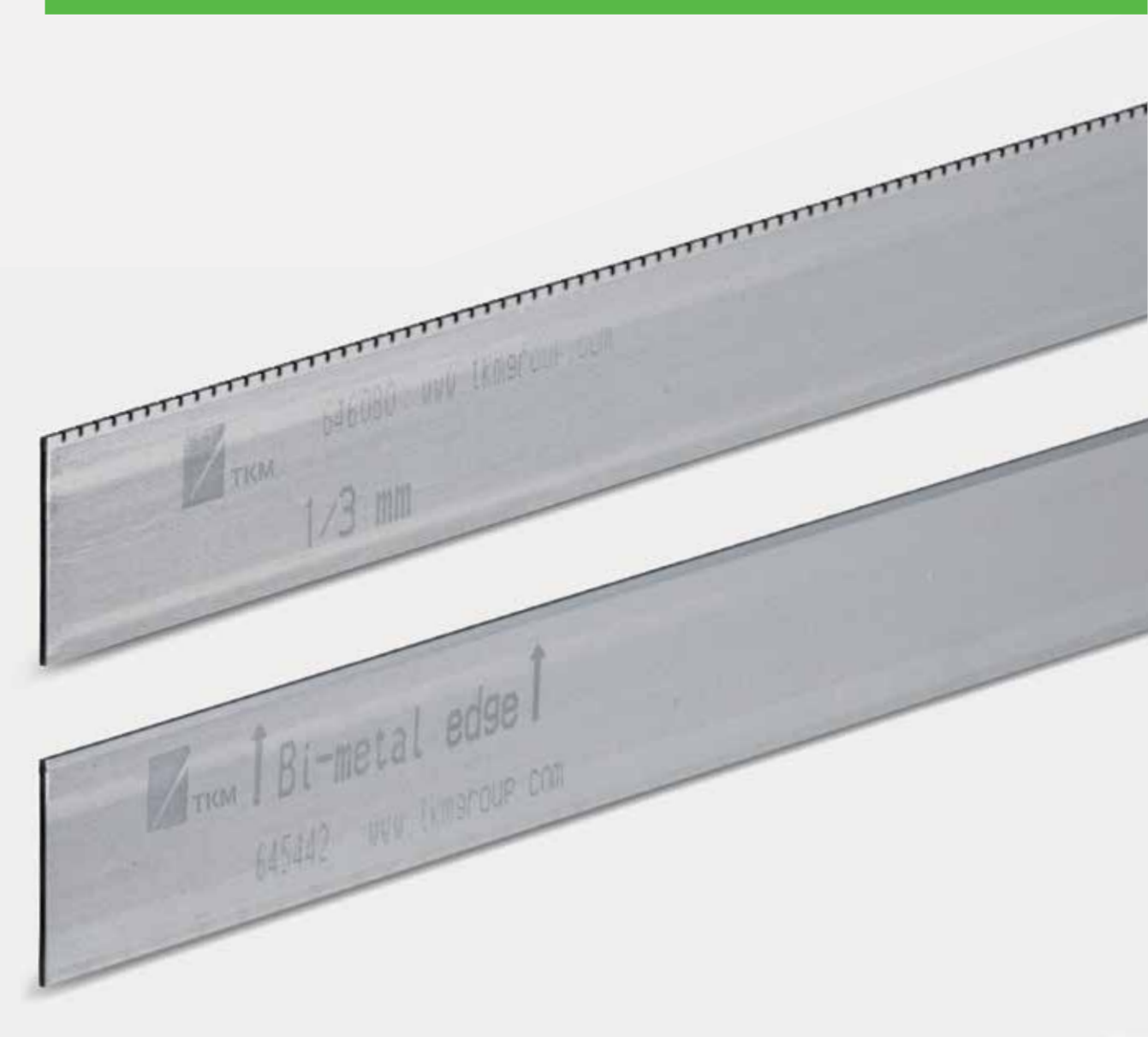
Perforation and anvil knives for all contemporary machines.