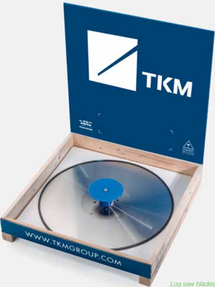
Log saw blades in crate