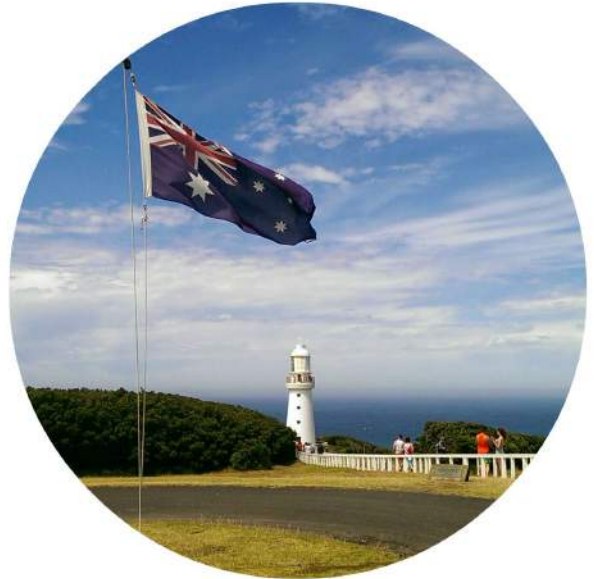
Splitpoint Lighthouse on the Great Ocean Road

The Great Ocean Road Memorial Archway was built to commemorate the 3000 Australian soldiers who built the road after returning from WW1 in 1918 – 1932.