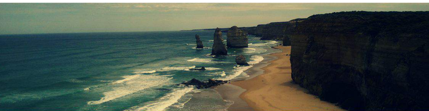
The mighty Twelve Apostles on The Great Ocean Road

Bells Beach – This is one of the most famous surfing beaches in Australia. The best time to go is during Easter where you can get to see the world's best surfers carve up the waves and compete for a trophy in the world-famous Rip Curl Pro Surfing Competition.