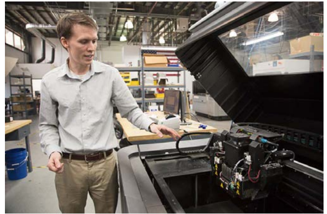
Example of a PolyJet 3D Printer