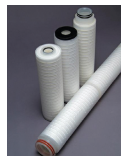
Figure 2 – Critical Process Filtration’s pleated filters with multiple membrane options are used for bacteria removal.

Contact Critical Process Filtration for help determining the best filter options for you.