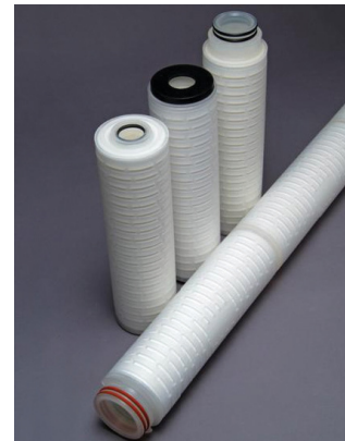
Figure 2 – Critical Process Filtration’s Pleated Filters with PES, PVDF, Nylon 6,6, Blended Cellulose and PTFE membranes are used for bioburden reduction and bacteria removal