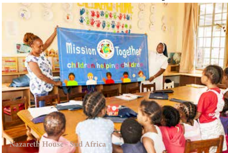
Nazareth House - Sud Africa

Many diocesan schools promote Catholic character education, based on