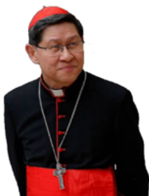
Cardinal Luis Antonio G. TAGLE, Prefect of the Congregation for the Evangelization of Peoples

VA31001000000040286004 (SWIFT/BIC: IOPRVAVX) (€) VA04001000000040286005 (SWIFT/BIC: IOPRVAVX) (USD $) for: Amministrazione Pontificie Opere Missionarie, indicating: Fund Corona-Virus