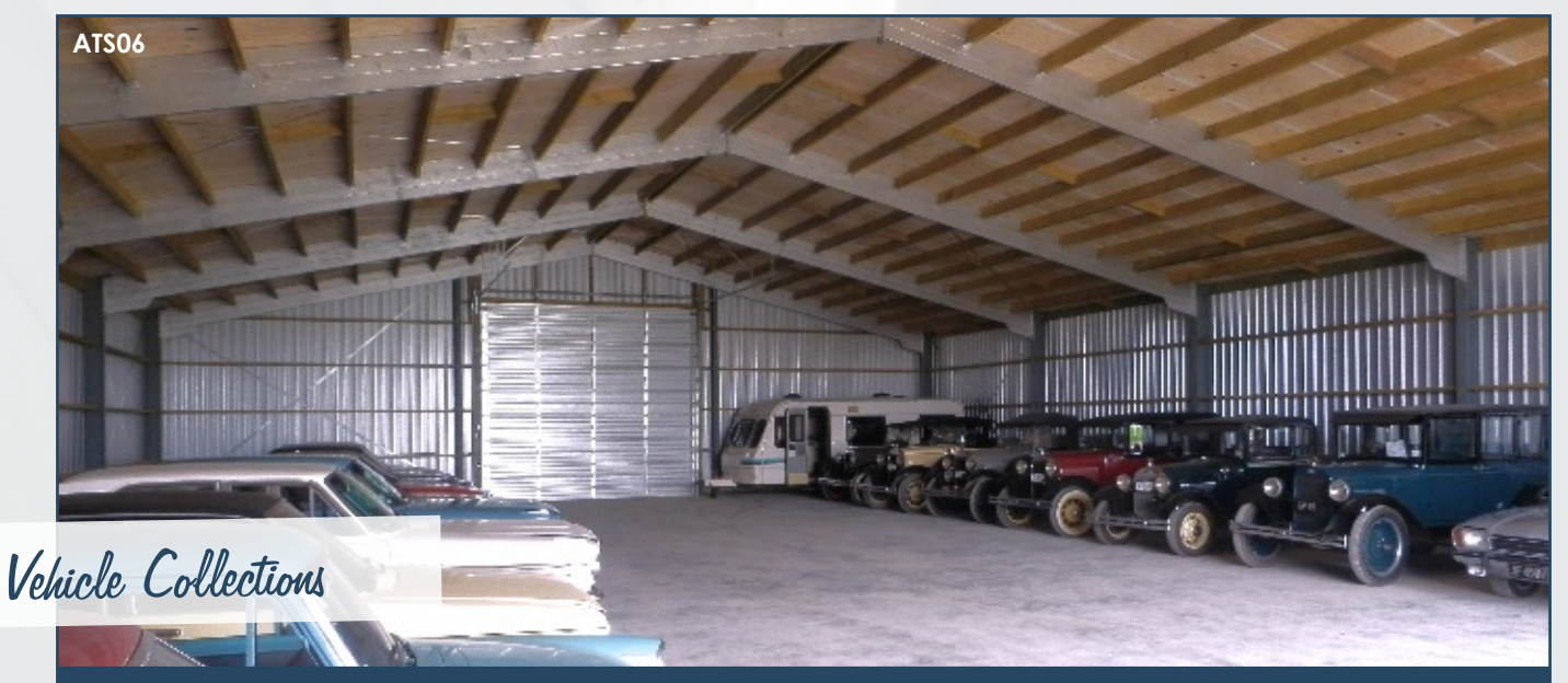
The minimilistic clearspan design helps you optimise storage space and work areas.