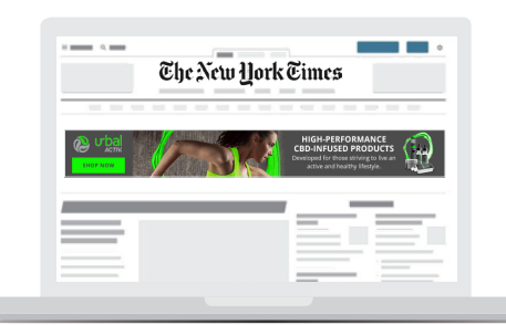
Customer is targeted in real-time with your company's ad using different segments such as customers' interests, geo-location, and overall business attributes.