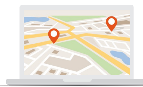
Customer searches for a CBD Shop near their location...