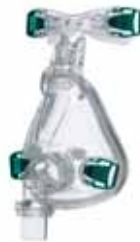
Ultra Mirage Full Face Mask for leak and therapy management