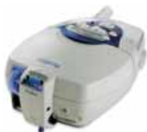
AutoSet CS2 with ResLink module records SaO2