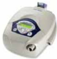
AutoSet CS2 with ResLink SmartMedia Card