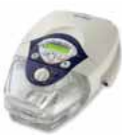
AutoSet CS2 with integrated HumidAire 2i humidifier