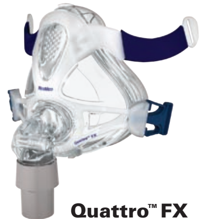
Quattro™ FX FULL FACE MASK

High-tech Spring Air cushion distributes pressure evenly and absorbs even the slightest user movements, so users can enjoy a good night's sleep, confident that their seal is safe.