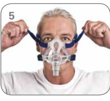
• Unfasten the Velcro®, pull the upper headgear straps evenly until they are comfortable and firm, and reattach the Velcro.