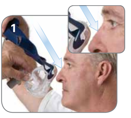
With both lower headgear clips released, position the cushion at an angle on the nasal bridge.

Prior to fitting your mask, remove the orange spring frame support from the rear of your mask and retain for future use.