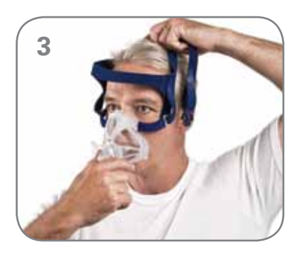
· Hold the mask firmly against the face and pull the headgear over the head.