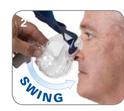
• Keeping the upper position of the mask in place, swing the lower half of the mask down against the face.