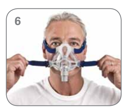
Repeat step 5 with the lower headgear straps.