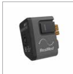
Oximetry module 37302 Oximeter converter cable 36941