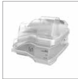
HumidAir heated humidifier 37300