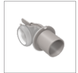
Air outlet 37310