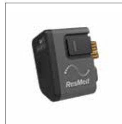
USB module 37301