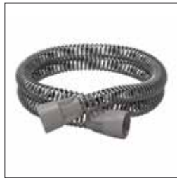
SlimLine™ tube 36810