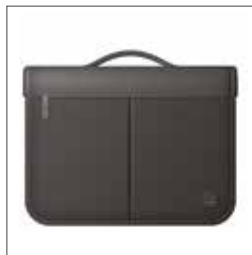
Travel bag 37304