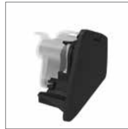
Side cover 37303 Charcoal