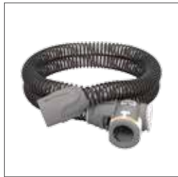
ClimateLineAir heated tube 37296