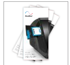
SD card with protective folder 37334 (1 pk) 37332 (10 pk) SD card reader 36931