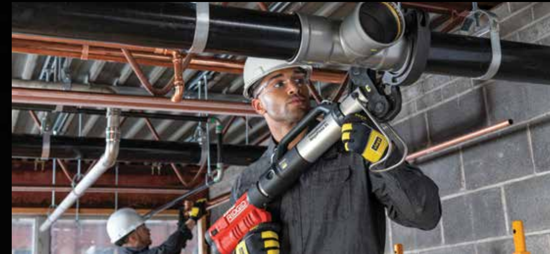
Secure, flameless connections on gas lines