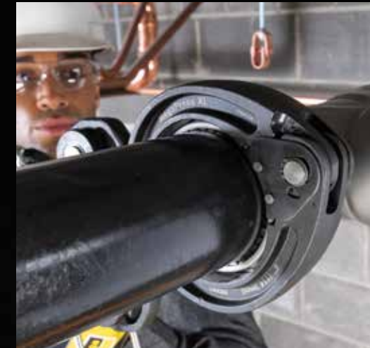
Connections take 16 seconds or less