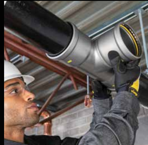
Available ½" to 4"