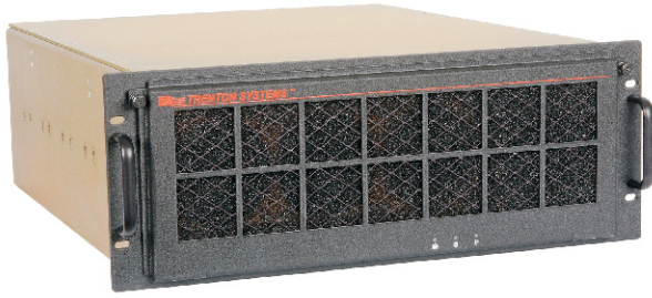
Trenton TMS4702 Military Computer Shown with a 14-slot backplane and a dual-processor SBC