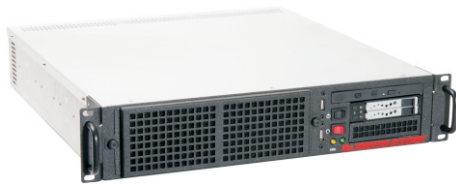
Trenton TRC2005 Rackmount System Shown with a butterfly backplane and SHB