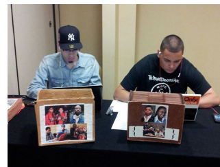
Congratulations Bronx Law High School!