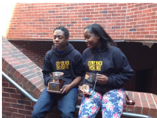
Congratulations ACORN Community High School!

The Tournament of Champions is the equivalent of the Olympics for scholastic debate. Only the top few teams from across the country are invited. Debate Teams have to win "bids" at major national debate tournaments ie "1st Place" at the Harvard University Debate Invitational. This year the New York City Urban Debate League made history by having not 1, not 2 but 3 different debate teams from NYC qualify for the National Championships. Congratulations and Good Luck to Brooklyn Tech, Bronx Law, and ACORN Community High School. All three teams are graduating seniors and their passion, skills, experience and support for debate as well as beginner and younger debaters are inspiring and its only the beginning of their debate and advocacy careers. Congratulations Everyone.