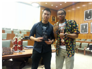
Congratulations Brooklyn Tech High School!