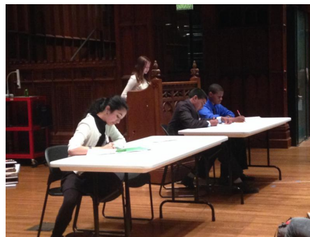
FDA Debaters win the City Championship at Columbia University