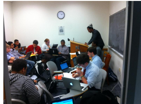
ACORN HS Debate Team Wins Big at Georgetown University!

Urban Debate League where all students can be Great Debaters and compete against the top schools across the nation every weekend.. and win! Two weekends ago our debaters triumphed at Yale University and last weekend our debaters triumphed over the most elite schools in the country to win multiple awards at the Georgetown University Debate Invitational! Our city's debaters competed against the nation's top schools including California, Florida, Texas, Georgia... and won! Shout outs to ACORN Community HS and the Bronx School for Law, Government and Justice for their incredible string of victories at Georgetown! And shout outs to our incredible city - schools, parents, teachers, students, principals, coaches, volunteers, alumni, donors, partners, staff, Board, and everyone who supports our mission that all students can be Great Debaters! Click here for our Georgetown tournament photo album!