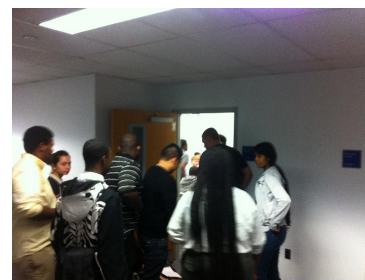
Standing Room Audience Only as NYC Great Debaters Make Cinderella Story at Georgetown Tournament

Tour of Georgetown University, tour of Washington D.C., delicious cupcakes from Georgetown Cupcakes (after waiting in a 2 block line!), observing the 6:00am rowers of the Georgetown crew team on the waters of the