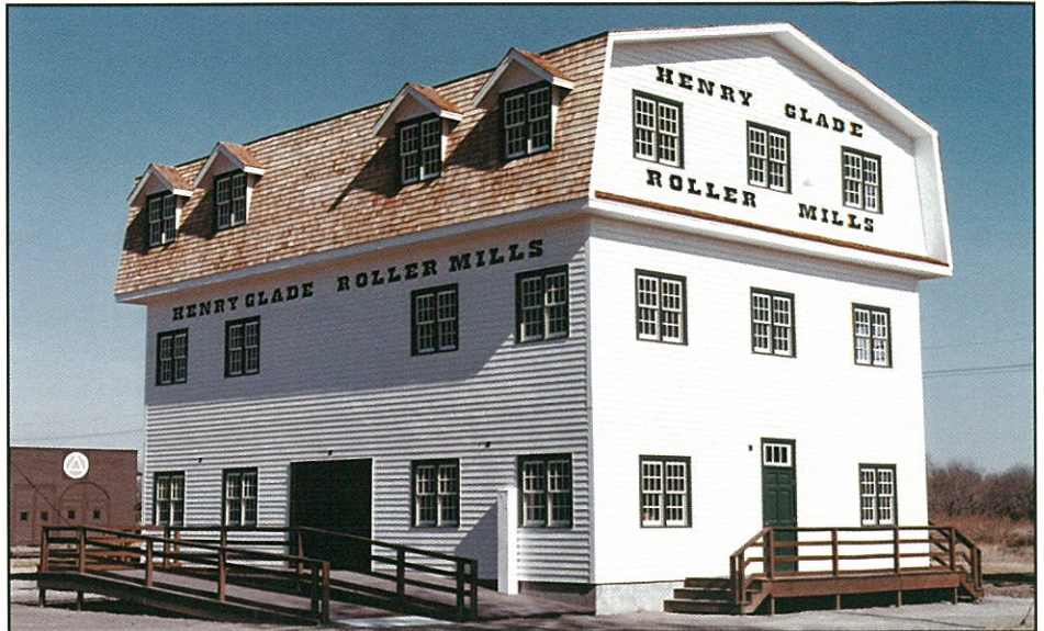
Glade Mill Replica for Stuhr Museum