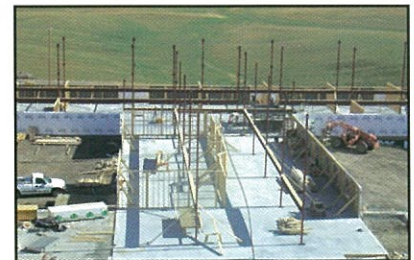
Northridge in progress