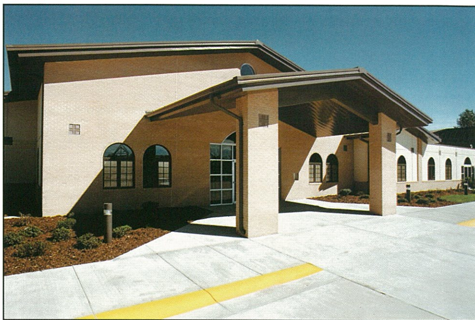
Blessed Sacrament Parish Center Addition

We hope you enjoy this and future issues, and we encourage your feedback. As in running our own business, we're always striving to improve, and by having you tell us what you like and don't like about The Lacy Ledger , we can work to make it better.