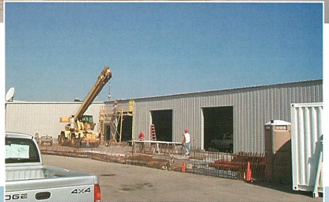
Bottom photo: Roy's Mazda building prep renovation