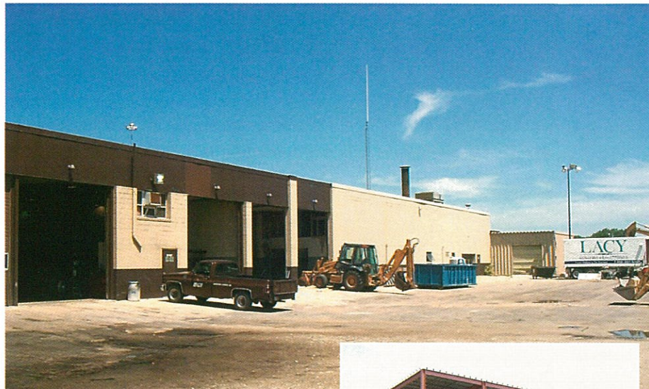
Above: Bosselman Travel Center service addition Right: University of Nebraska at Kearney Student Union Addition