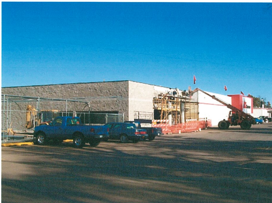
The Ace Hardware addition in progress.