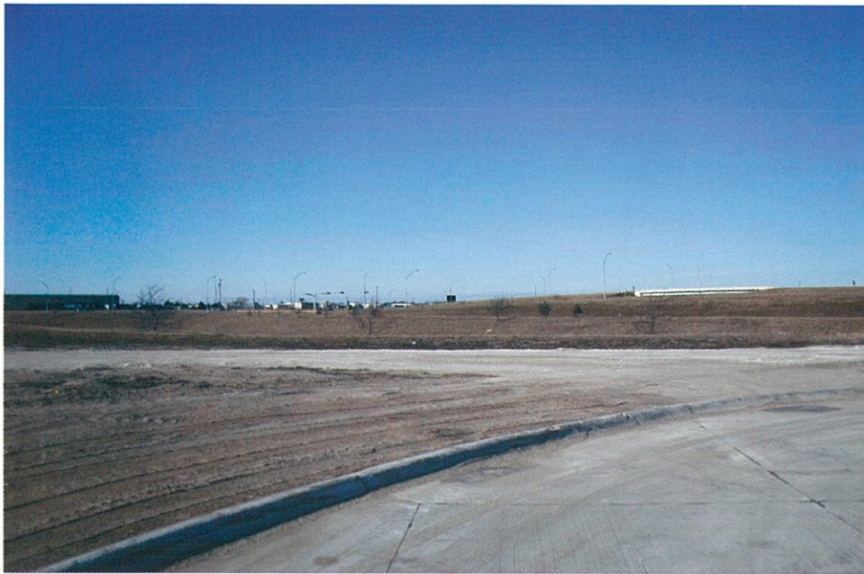
A view of the Highway 281/Highway 30 intersection from Lot 3, one of the build-to-suit opportunities Lacy has available.