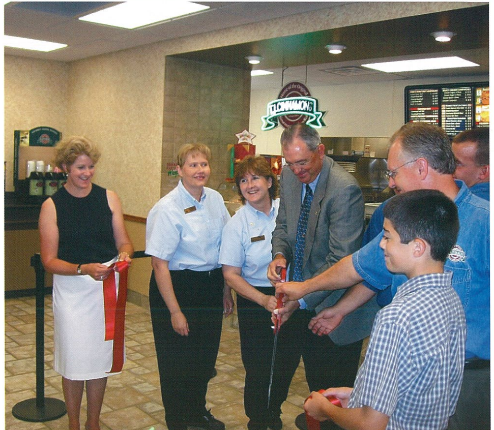
Arby's South Locust Street ribbon-cutting

We encourage you to support your local United Way.