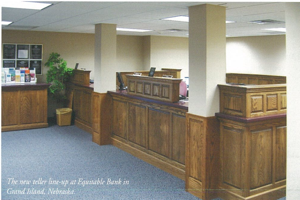
The new teller line-up at Equitable Bank in Grand Island, Nebraska.