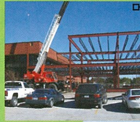
The beginning of our third addition project for Principal Financial in Grand Island. Look for more on this project in upcoming issues of The Lacy Ledger.