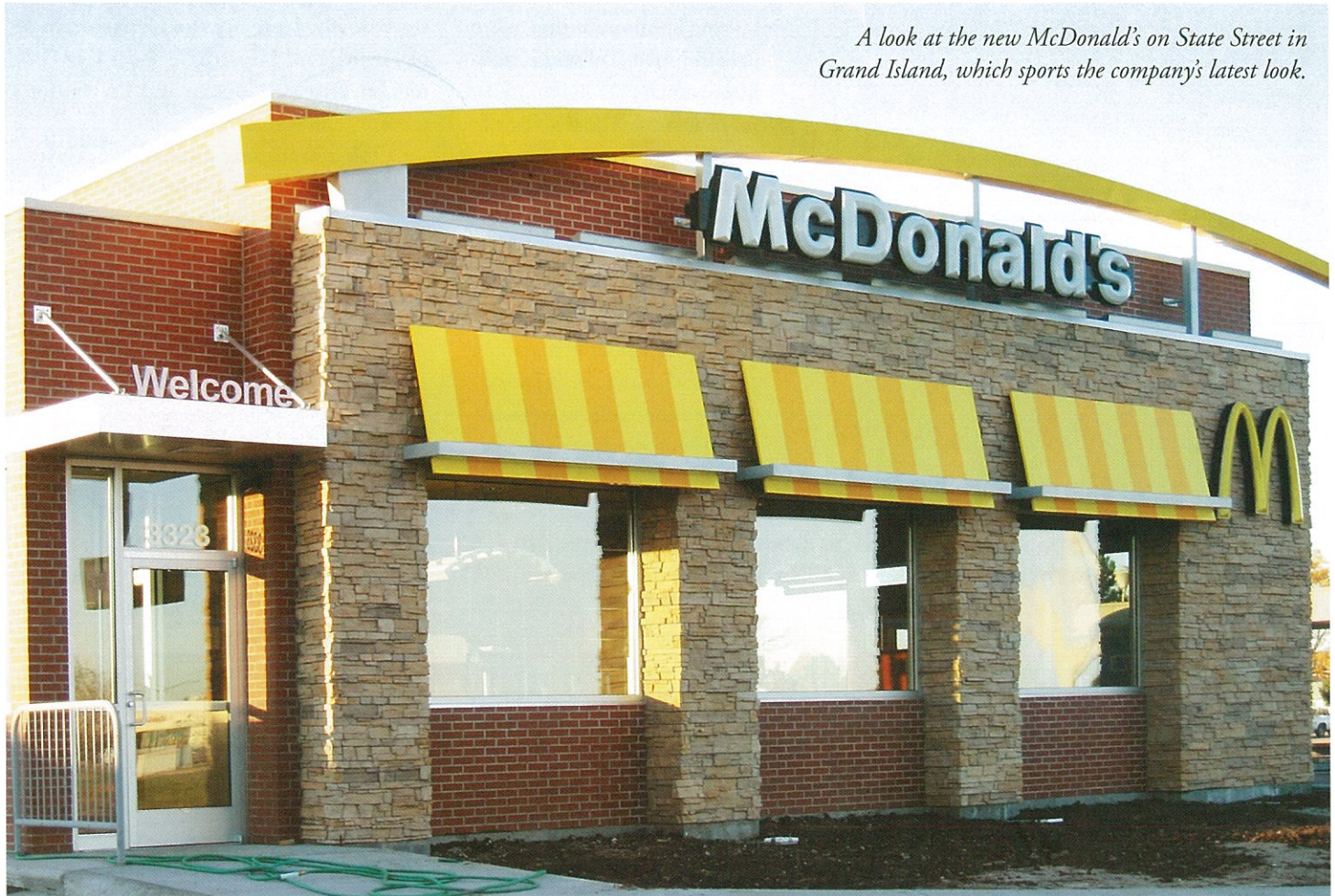
A look at the new McDonald's on State Street in Grand Island, which sports the company's latest look.

Construction news and trends, plus a little light-heartedness