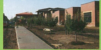
Howard County Hospital's clinic addition with the new entry shown under construction.