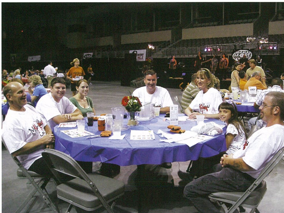
One of two tables filled by Lacy staff and guests at the 2008 Heartland United Way Moo-Claw. Lacy Construction has been a top campaign contributor in both 2007 and 2008.