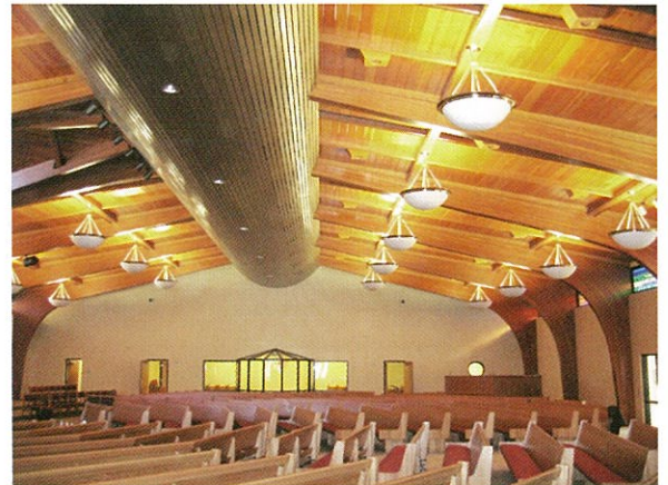
A view of the new ceiling, lighting and pews. They say a picture is worth a thousand words... (unfortunately, a picture will never do justice to the beauty of this room.)