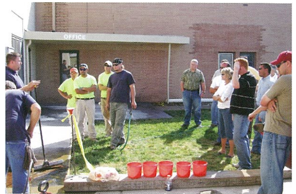
Learning the ins and outs of decorative concrete.

As we sit in the middle of our Nebraska winter, now is a perfect time to put these ideas to work and discuss implementing green building concepts in your upcoming projects or planning some spring decorative concrete work. Contact Tim at tim.rush@lacygc.com or give him a call at 800-321-5229 to begin your own green movement.