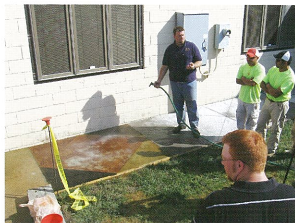
Just a small section showing some of the styles and color samples we now have outside the Lacy offices. Stop by and we will show them all to you.