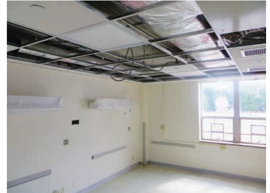
A typical resident room undergoing renovation.

Given the scope of work, the entire project will take approximately 3-1/2 years to complete, ultimately providing our deserving veterans the comfort and facilities they have earned by their sacrifices to preserve our freedom. We're proud of these men and women and highly gratified that we can serve them in this way.