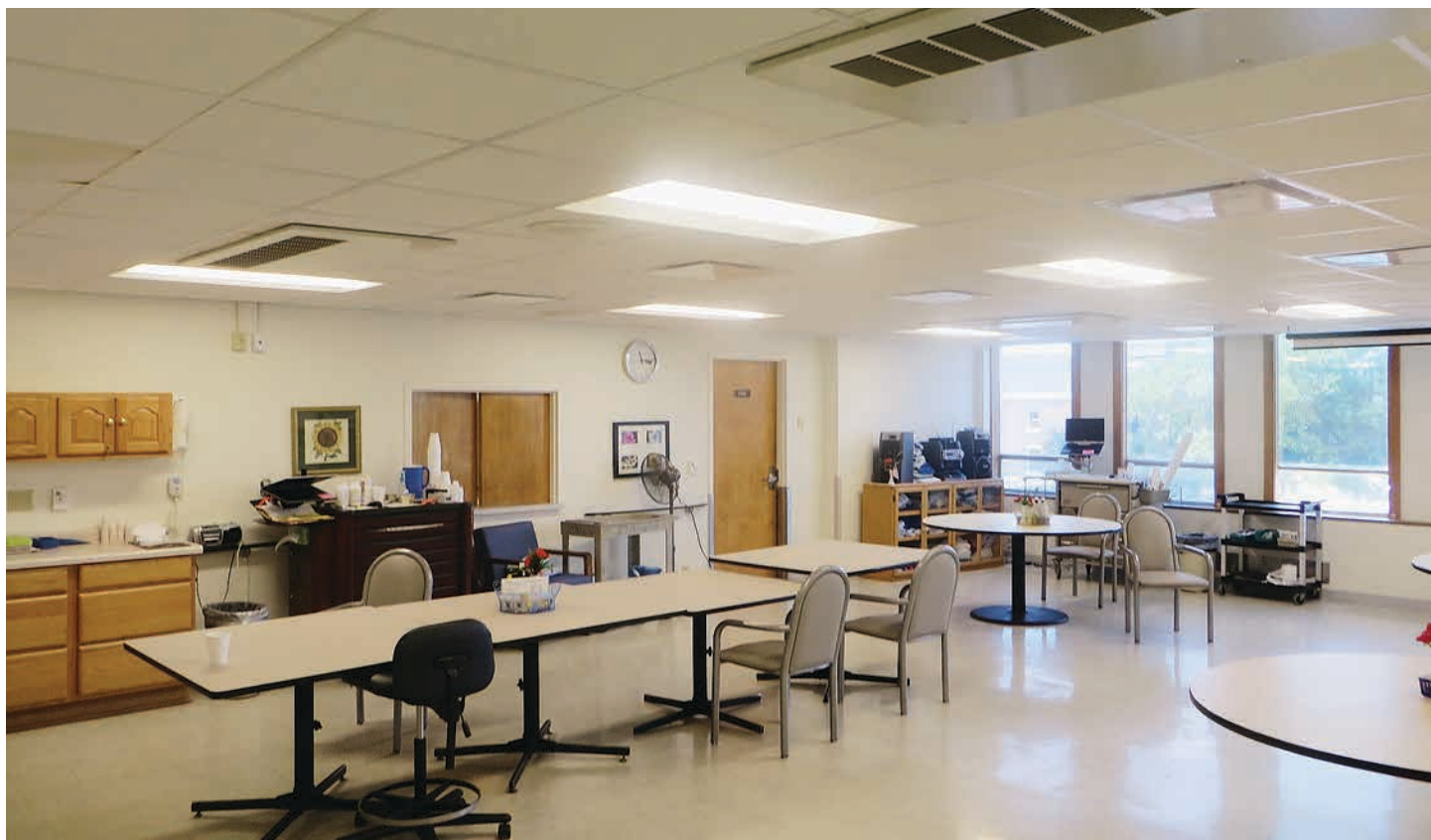
The completed third floor commons area.

Construction news and trends, plus a little light-heartedness