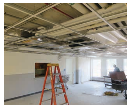
Third floor commons while under construction.

Inside, new ductwork was required and fire sprinklers were added to protect areas where previously there had been no sprinklers. Of course, that meant