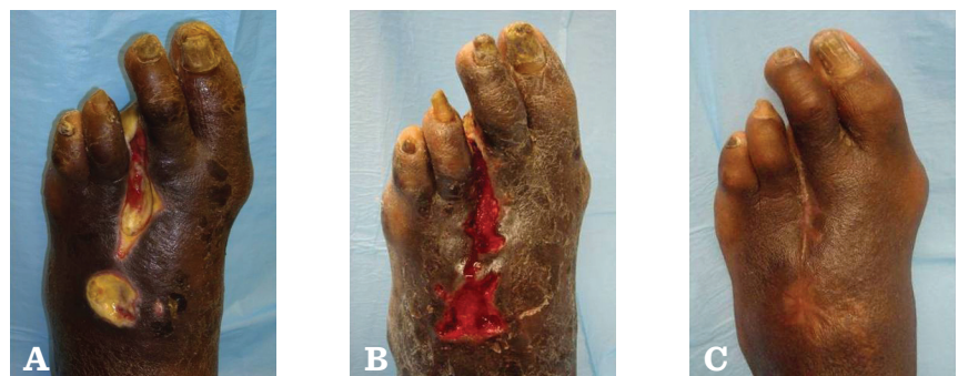
FIGURE 3 Progression of a diabetic foot ulcer from necrotic wound base (A), to surgical debridement (B), to complete healing (C).

Surgical debridement is arguably the most common and varied type of debridement (Figure 3). A myriad of instrumentation and adjuncts are used to physically excise non-viable tissue from the wound bed, either at the bedside, in the clinic, or in an operating room. The surgeon will debride tissue to viability, as determined by tissue character and the presence of vascularity in healthy tissues, using any combination of instruments, such as rongeur, curette, blade, scissors, and forceps.