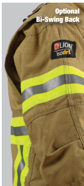
Optional Bi-Swing Back