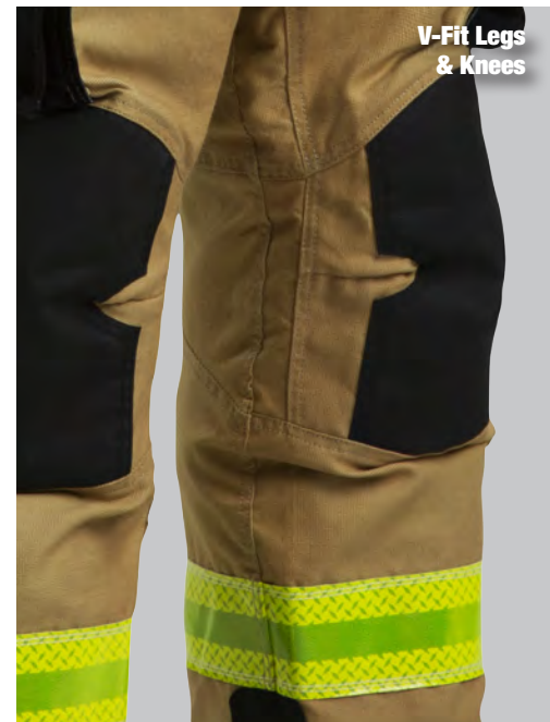
V-Fit Legs & Knees