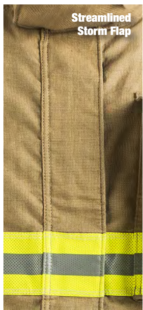
Streamlined Storm Flap