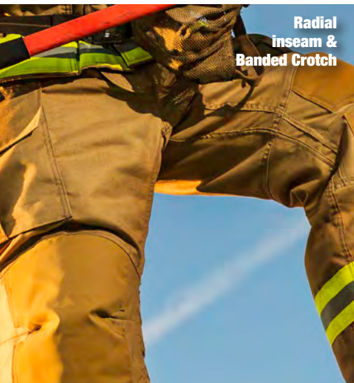
Radial inseam & Banded Crotch