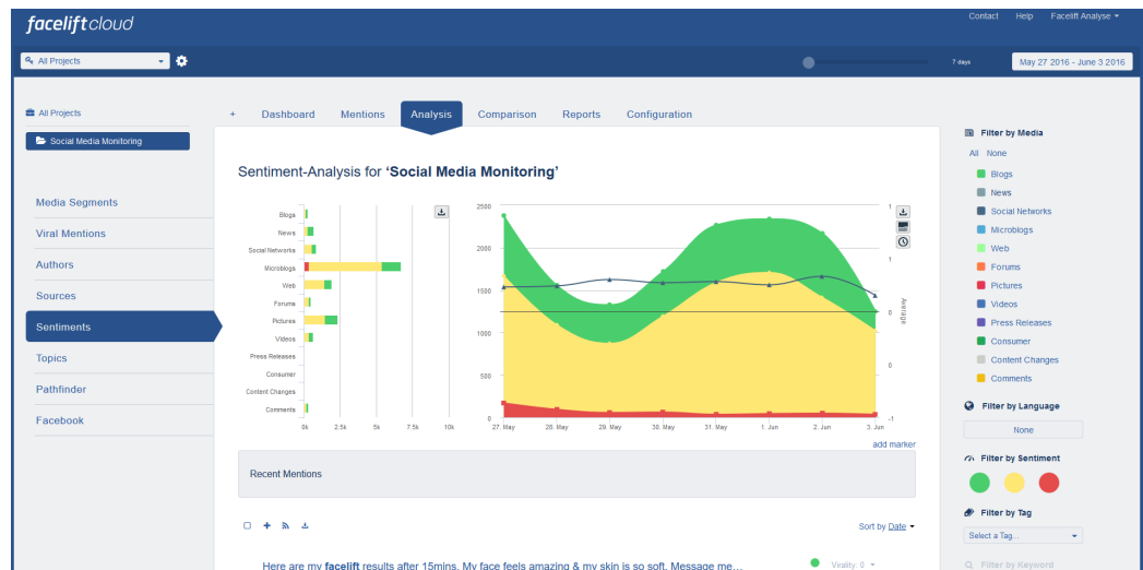
Sentiment analysis by time and date, including filtering options and mention index

The reporting shows a significant improvement in sentiment by 20 percentage points in the first six months, as many social media players are thankful for the excellent customer service and actively express their gratitude in a way that is visible to third parties. Furthermore, several forum users turn into multipliers, who are encouraging other users to openly post their questions, as "the great customer service team of X is reading this anyway and is happy to help out." The fact that such statements also appear in media, in which the company has not yet answered any questions, is noteworthy.