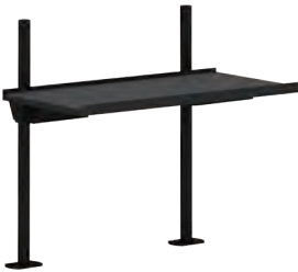
UTILITY SHELF W5780