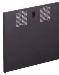
LIFT-OFF PANEL 64100