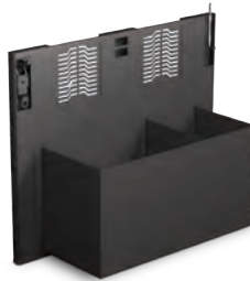
FILE STORAGE BIN (Door Sold Separately) 56088