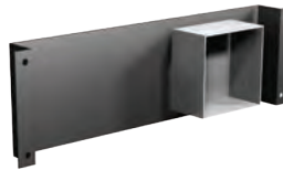
ELECTRICAL BOX WITH BRACKET 64264