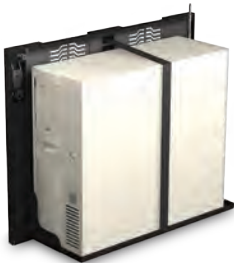
CPU SHELF (Door Sold Separately) 56087