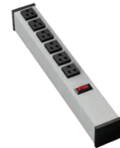
POWER STRIP 51710