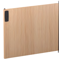
WOOD DOORS 56569