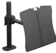
TELEPHONE TRAY W6469