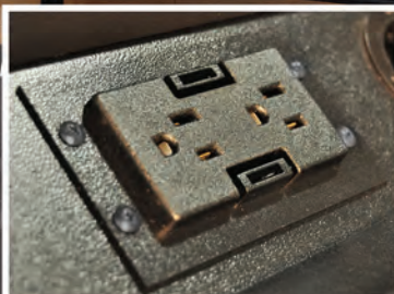
DUPLEX OUTLET INSTALLED