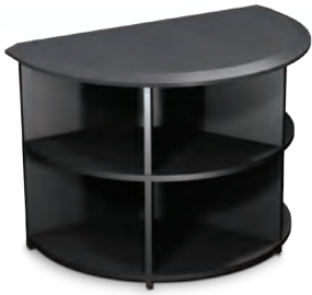
RADIAL END CREDENZA W6430 / W6431