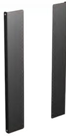
RACK RAILS 56165