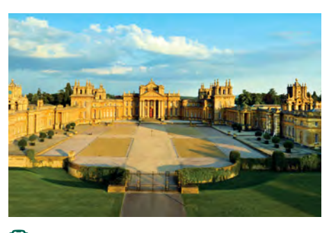
Day 8 • Blenheim Palace & The Cotswolds

Today we visit Blenheim Palace, home to the 12th Duke of Marlborough, birth place of Sir Winston Churchill. Visit the gilded State Rooms and also see The Churchill Exhibition, taking you on a journey of his life. This afternoon, we'll tour some of the 'chocolate box' Cotswold villages known for their local limestone cottages and individual character. Overnight in the Oxford area. (B, D)