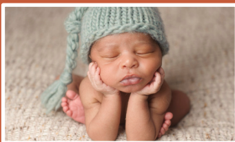
A BLESSING IN THE MESS

*Names throughout this newsletter have been changed to protect the privacy of individuals.