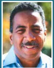
ENDING ABORTION IN THE CHURCH