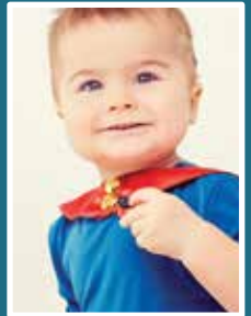
SAVE MORE LIVES... EVERY MONTH!