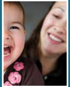
ABORTION: HER ONLY HOPE?