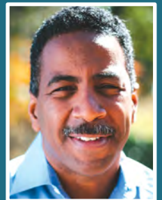
I'M NOT PRO-LIFE ANYMORE (P. 4)