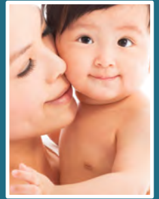
AN UNLIKELY VOICE FOR LIFE (P. 3)