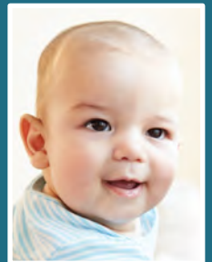
SAVE LIVES FOR COST OF A CUP OF COFFEE