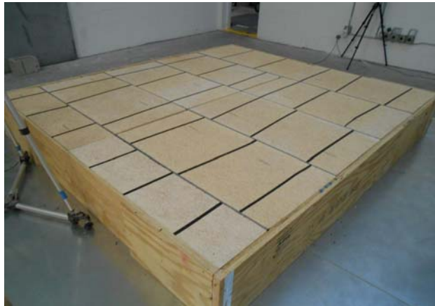
E400 test with 5/8" Envirocoustic Wood Wool (1" backing)

Surface area: 6.69 m 2 Room volume: 234.4 m 3