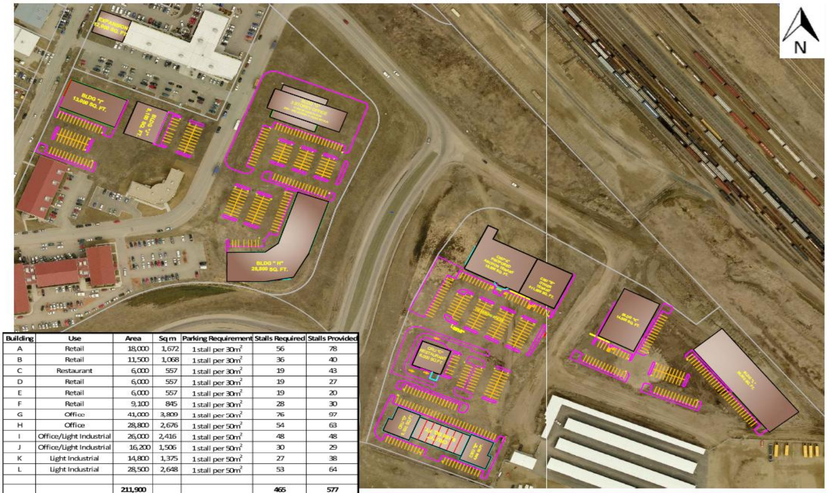
FIGURE 4.1 PROPOSED SITE PLAN