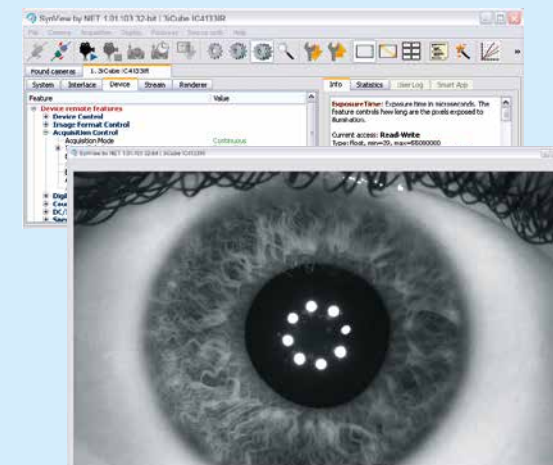
Eyetracking with NIR

NET supports all GenTL consumer image processing libraries, i.a. Adaptive Vision Studio, Halcon, VisionPro, LabView Vision, and MATLAB.