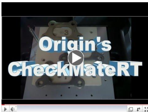
Origin's Gauging Solution