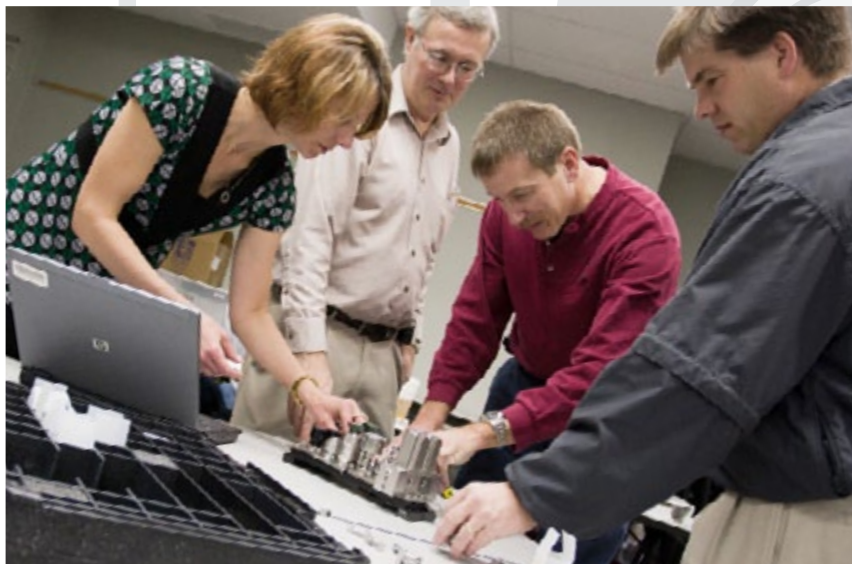
Students participate in an interactive exercise, designing and building a sampling system.

Learn more about PASS training at southeasttexas.swagelok.com