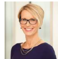
Emma Walmsley CEO GSK