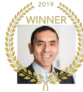
Ugur Sahin CEO BioNTech