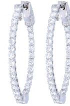
Photo may not be to scale and is for general design and appearance purposes.

This report is based on generally accepted grading techniques. Characteristics are determined using millimeter gauge, master comparison stones, UV Lamp, 10x loupe or binocular microscope.