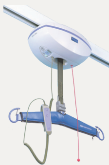
Maxi Sky® 2

Our 60 years of experience, combined with our broad range of bathing and showering products enable a calm, safe and comforting environment to perform person-centered care during essential tasks.