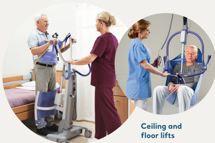
Ceiling and floor lifts

Our solutions and clinical services are designed to help reduce caregiver and patient injuries and patient falls while improving outcomes.