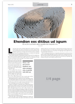
Full page article + 1/4 page ad • max. 900 words