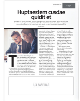
Full page article + 1/4 page ad • max. 310 words