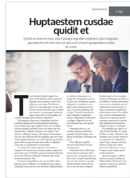
Full page article • max. 390 words