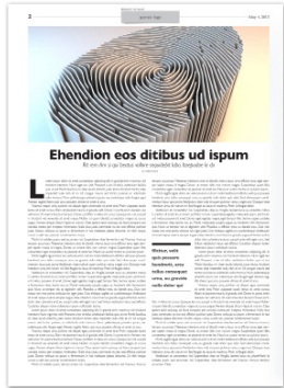
Full page article max. 1,170 words