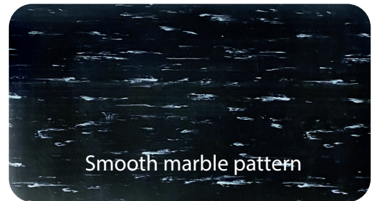
Smooth marble pattern

Visit us @ crownmats.com or call-1-800-MAT-LINE 2100 Commerce Drive, Fremont, Ohio 43420