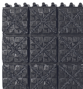
777 Grit Safe Drain Through