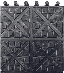
775 Solid Top