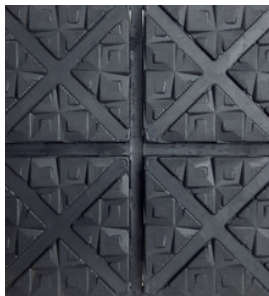
776 Drain Through