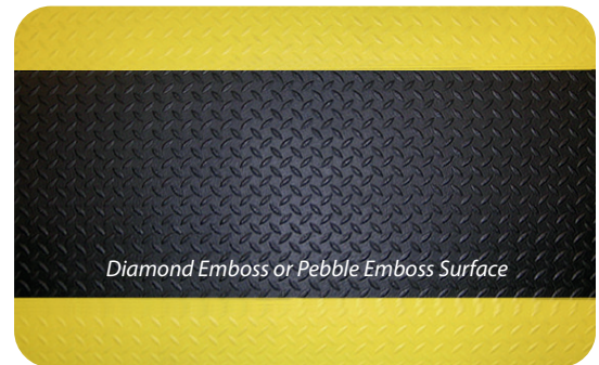
Diamond Emboss or Pebble Emboss Surface