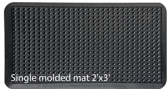
Single molded mat 2'x3'